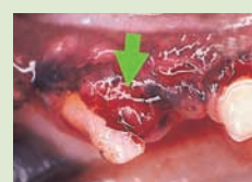
Tooth resorptive lesions Typical lesion (arrowed). The tooth is progressively destroyed and is usually very painful.