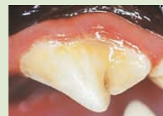
Gingivitis with inflamed gums