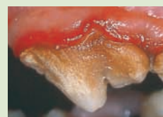
Periodontitis with gum loss