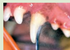
Scale and Polish: Removing the calculus using an ultrasonic scaler, followed by polishing, is a very effective form of treatment